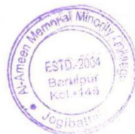
Principal Al-Ameen Memorial Minority College Jogibattala, Baruipur, Kol.-145

Objective: Develop foundational coding skills through hands-on projects and problem-solving exercises.