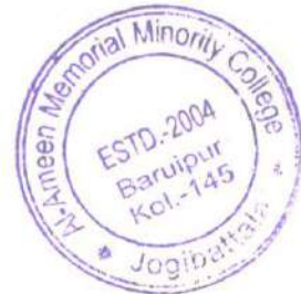
Principal Al-Ameen Memorial Minority College Jogibattala, Baruipur, Kol.-145

Objective: Train students in correct and fluent recitation of the Quran, emphasizing Tajweed and spiritual reflection.